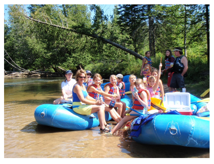
We've hosted groups from all over Michigan, and all age groups.